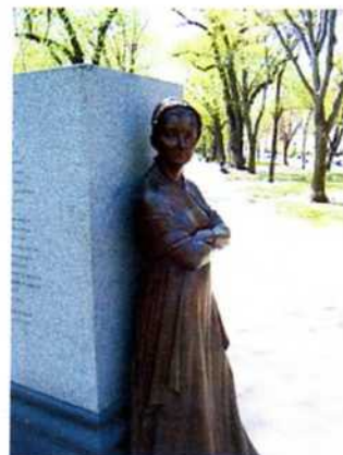
Adams as a part of the Boston Women's Memorial on Commonwealth Ave.

John declined Abigail's "extraordinary code of laws," but acknowledged to Abigail, "We have only the name of masters, and rather than give up this, which would completely subject us to the despotism of the petticoat, I hope General Washington and all our brave heroes would fight."