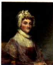
Abigail Adams, later in life, by Gilbert Stuart First Lady of the United States In Office March 4, 1797 – March 4, 1801

Abigail Adams ( née Smith ; November 11, 1744 – October 28, 1818) was the wife of John Adams, who was the second President of the United States, and the mother of John Quincy Adams, the sixth. She was the first Second Lady of the United States, and the second First Lady of the United States.