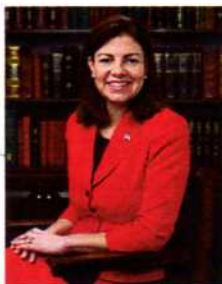
Kelly A. Ayotte

Kelly A. Ayotte (born June 27, 1968) is the junior United States Senator from New Hampshire and a member of the Republican Party. She earlier served as the Attorney General of New Hampshire.