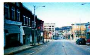
Jeannette Business District (Clay Avenue)

With a current population of around 10,000, Jeannette lies near the center of Westmoreland County between Routes 30 and 22. It is approximately 25 miles east of Pittsburgh and four miles east of the Irwin interchange on the Pennsylvania Turnpike.