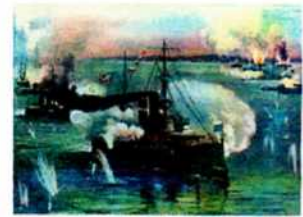
Olympia at the Battle of Manila Bay

As tensions increased and war with Spain became more probable, Olympia remained at Hong Kong and was prepared for action. When war was declared on 25 April 1898, Dewey moved his ships to Mirs Bay, China. Two days later, the Navy Department ordered the Squadron to Manila in the Philippines, where a significant Spanish naval force protected the harbor. Dewey was ordered to sink or capture the Spanish warships, opening the way for a subsequent conquest by US forces.