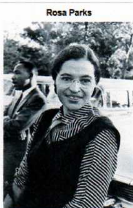
Rosa Parks in 1955, with Martin Luther King, Jr. in the background

~ Rosa Parks, African-American civil rights activist ~