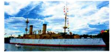
USS Olympia at the Independence Seaport Museum in 2007.

Docked in Philadelphia, the world's oldest floating steel warship worldwide, the USS Olympia was launched in 1892 and is the only remaining naval ship of the Spanish-American War.