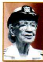
Dr. Grace Murray Hopper

Inventor Grace Murray Hopper was a curious child. At the age of seven, she dismantled her alarm clock to figure out how it worked, but was unable to reassemble it. By the time her mother figured out what she had been up to, the young Grace Hopper had gone through seven clocks in the house. This intellectual curiosity would later play an integral part in earning Hopper a place among the ranks of the most famous women inventors.